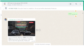
Recomnatation .png 501K